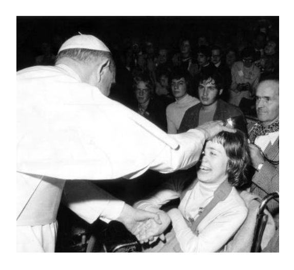
From the Vatican, 25th October 1975

Honour to all those who occupy themselves by introducing them into faith and into the light of a more open life! To them, and to the person with disabilities who are here today, and also to all those who were unable to come, our paternal Papal Blessing!