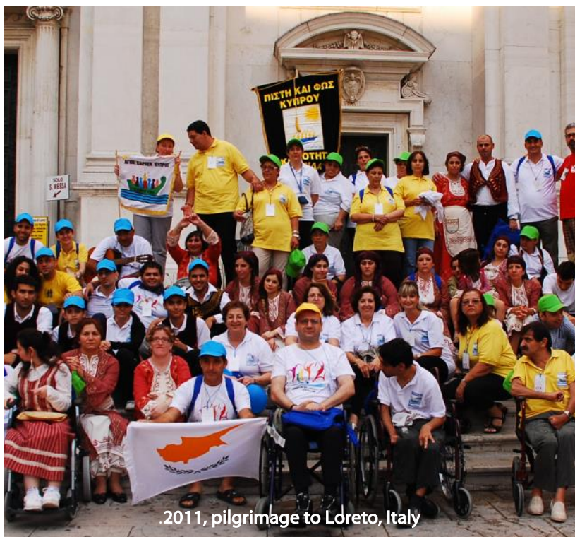
2011, pilgrimage to Loreto, Italy