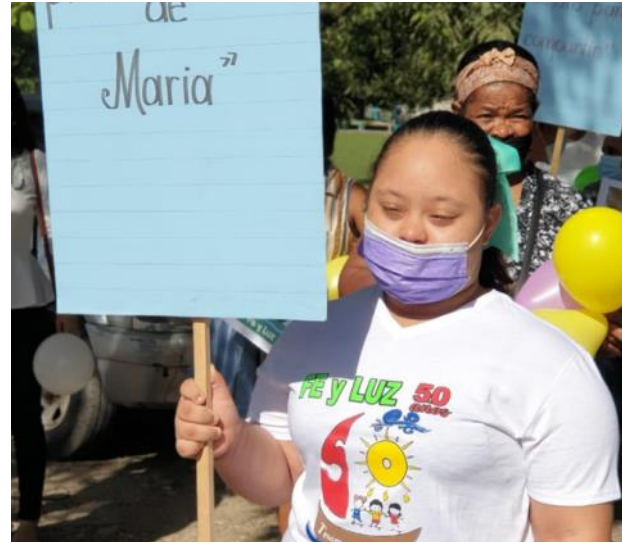
Pilgrimage "Heart of America and the Caribbean"

During this year, the virtual or actual pilgrimages have been special events in the life of the communities. Each province, in its own way, went on a pilgrimage on the theme: “A