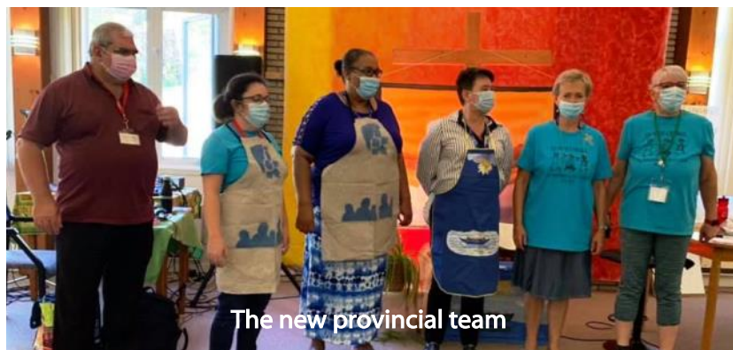
The new provincial team