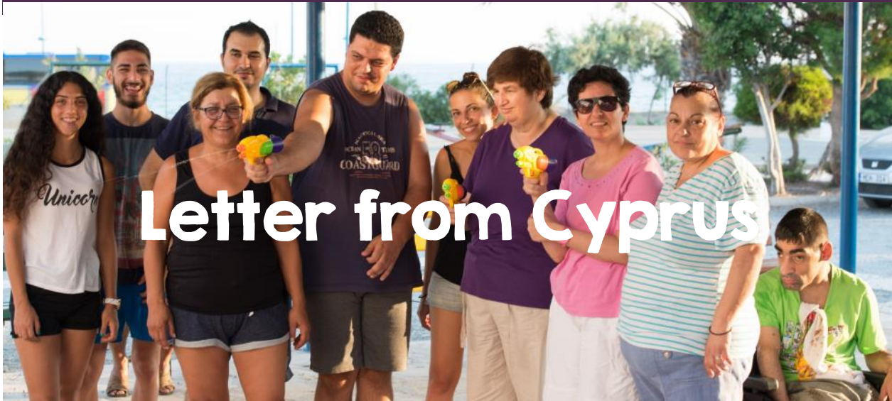
In Ayia Napa, during a summer camp

T he "Faith and Light" message arrived in Cyprus 35 years ago in September 1985 when a group of young people from the Lebanon communities visited the island and contacted a few families from the Maronite community so as to start some communities in Cyprus.