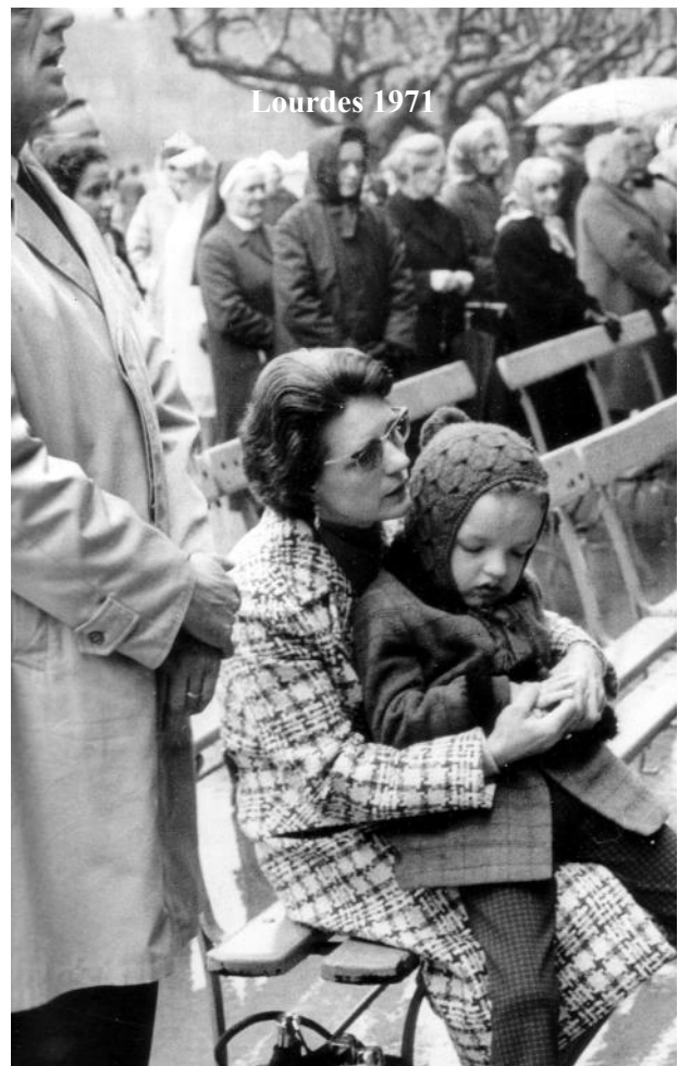
"Never again alone", page 181