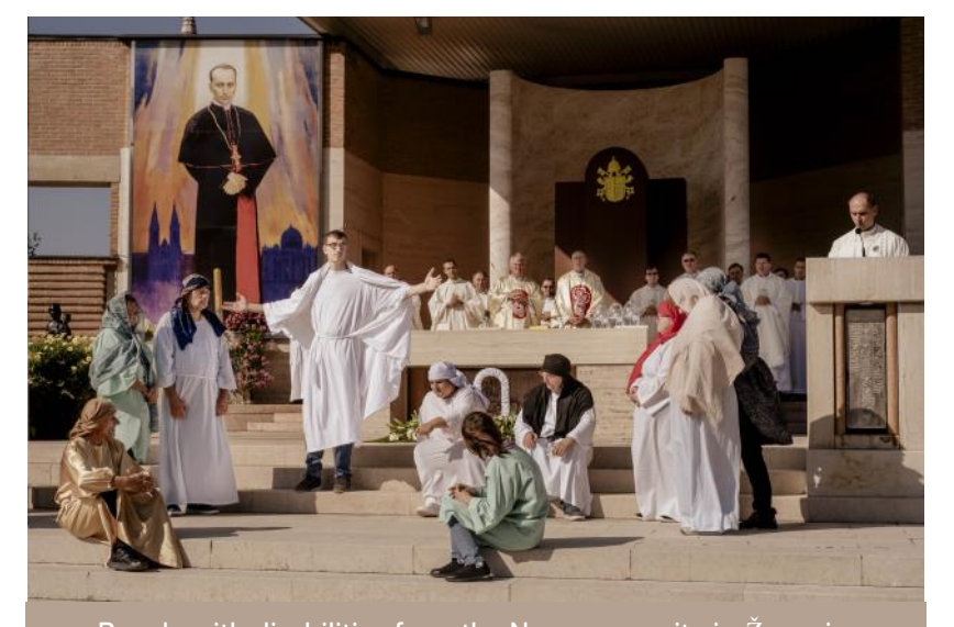
People with disabilities from the Noa community in Żupanja, together with their friends, mimed the Gospel of Luke 11:27-28.

A mother, a person with disabilities and two young friends