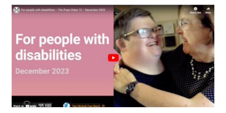
Link to the Pope's video: https://thepopevideo.org/?lang=en

And so, creating a completely accessible parish does not only mean eliminating physical barriers. It also assumes that we stop talking about "them" and start talking about "us." Let us pray that people with disabilities may be at the center of attention in society, and that institutions offer inclusion programs that enhance their active participation.