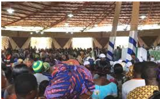
St Monique Church of Kombonlouaga

Before leaving, we wrote down their names and addresses, drew up a calendar of meetings and planned this year's activities with them. We will try to meet on the first Saturday of every month.