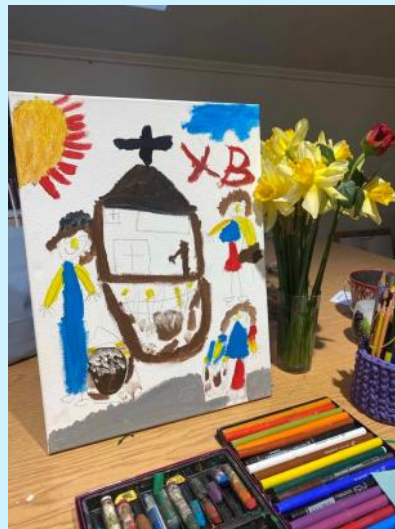
Yulia Kurylyak Ukraine