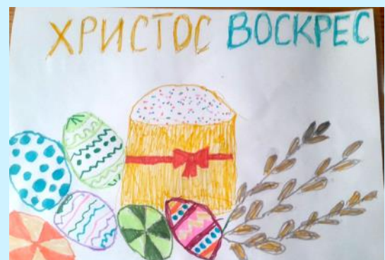
Havtur Ostap Ukraine