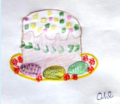
Olya Babii Ukraine